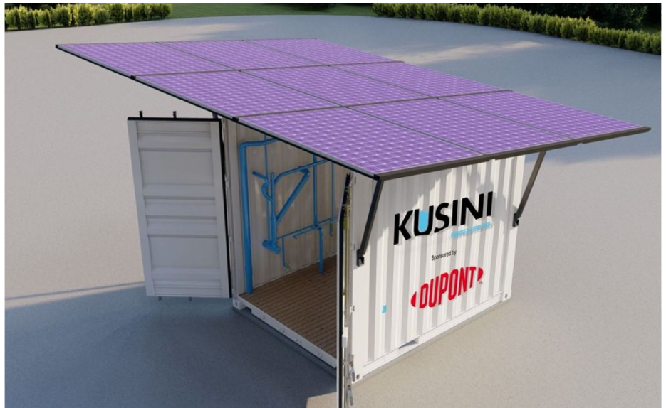
Kusini Water's solar-powered water filtration system

This reduces the cost of production, and minimises the amount of fossil fuel in water production.