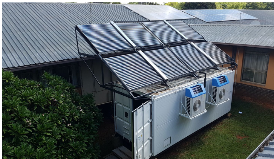
Eco-V's GreenTower technology