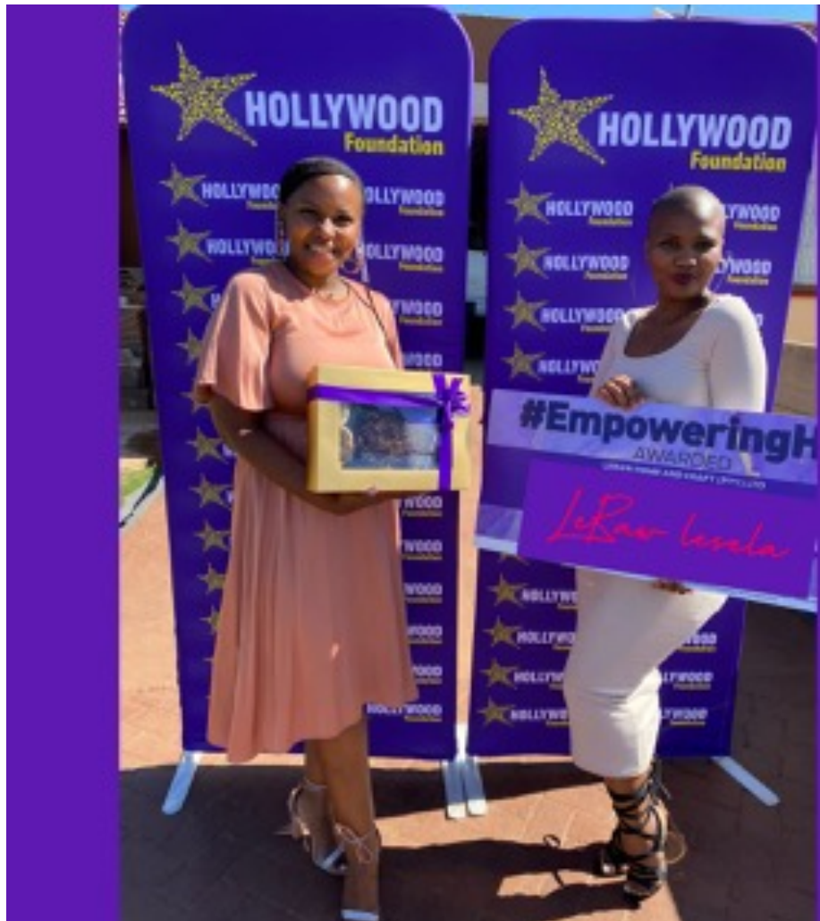
LeRaw Home and Crafts

Hustle competition with dreams of creating employment opportunities for others. Their dream of building up their community and creating jobs was well received by the judges and they won R50 000 cash prize and a business development programme that is worth R30 000.