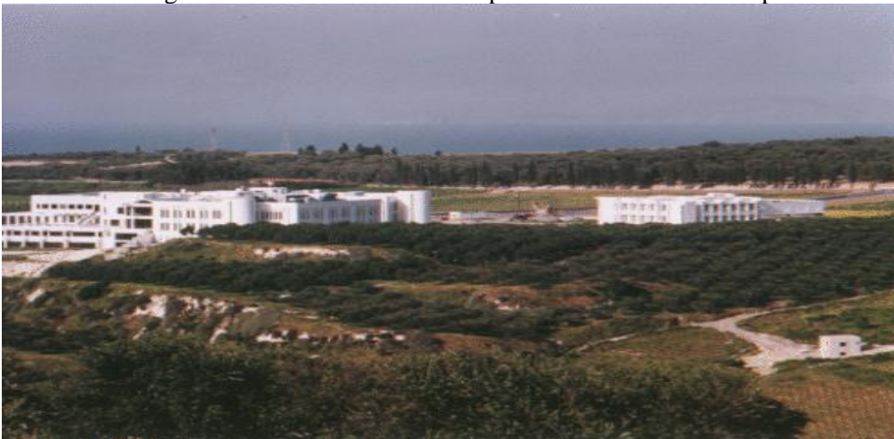
Fig. 2: The buildings of STEP-C (Heraklion, Crete)

STEP-C provides space and support for development to small innovative companies, at their early stage of development, or hosts R&D departments of established companies, willing to collaborate with the Research Institutes to develop new products or services. The Park provides technological and administrative support, Internet and networking services, support for business planning and financial services as well as patent and library services. Some of the services are provided free of charge. The cost of office and lab space is half of the market price.