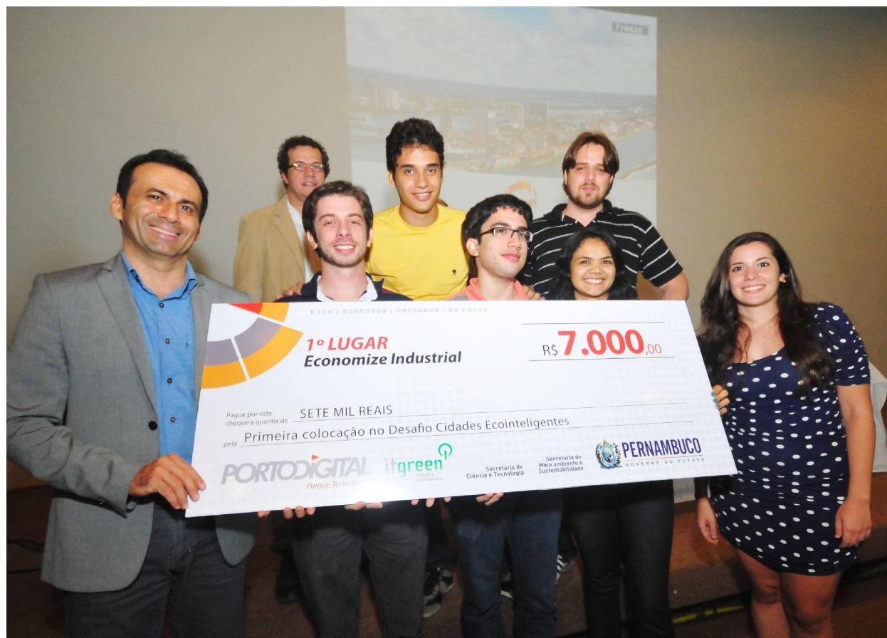
Figure 4: Award ceremony of the Challenge Eco Smart Cities 1st Place - Economize Industrial

Project Areas: Management, reverse logistics and recycling of waste (garbage); Reduction of waste water; Decentralized generation and use of electricity Sharing vehicles to improve urban mobility; Protection of natural resources; Management of urban services with artificial intelligence; Monitoring the state of conservation of urban goods and biodiversity monitoring environmental risk; Balanced urban planning and solutions to reduce displacements in the city; Alerts for effects of climate change; Mapping of land use, facilitating systematic planning of the occupation of the city; Accessibility solutions for people with special needs, among others.