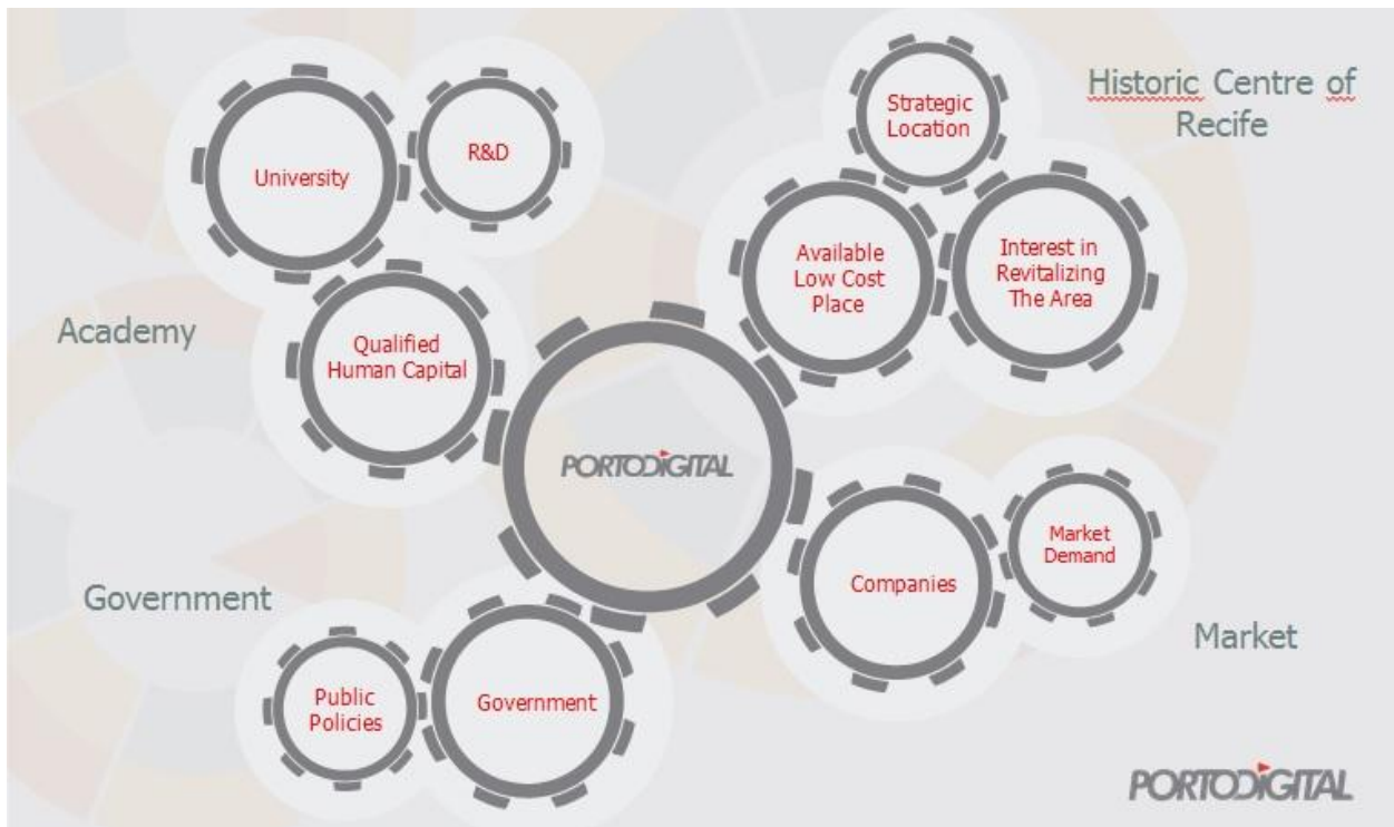
Figure 1: The scenario in which the Porto Digital was created

PD is the result of an innovation environment in Pernambuco which was consolidated in recent decades along with the coordinated effort of the university, the productive sector and the government, in order to insert the industry of ICT in the economic matrix of the State. Sector of high growth potential, ICT is also the basis for increasing the competitiveness of a region. 11