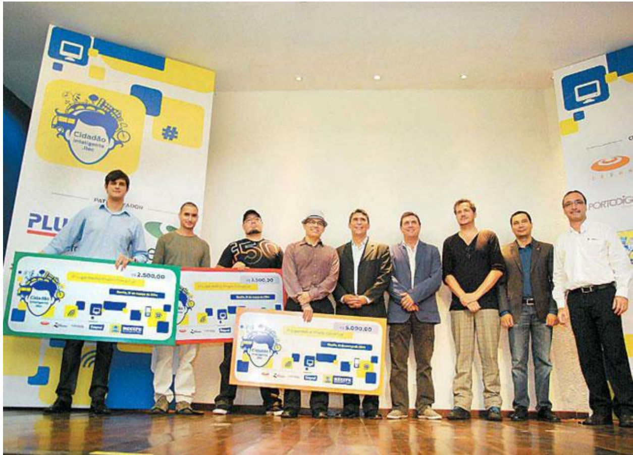
Figure 5: Award ceremony of the Intelligent Citizen

Project Areas: mobility, sustainability, tourism, security, education, healthy and solid waste.